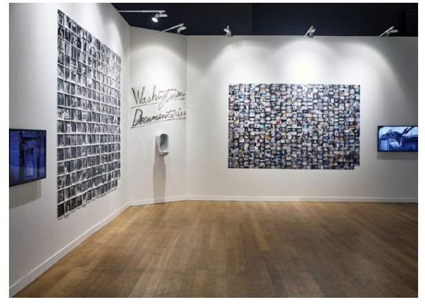
WASHINGTOWN DOCUMENTARIES, 2017 installation view at Prism sector, Paris Photo, Grand Palais, Paris, France