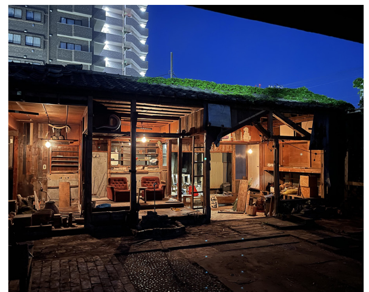
The Washingtown Site (East side), 2024