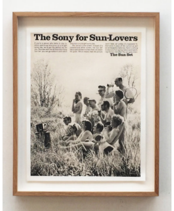
Remnants' Replay, 2018 collotype print on Washi paper