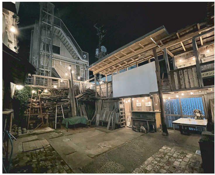
The Washingtown Site (West side), 2020